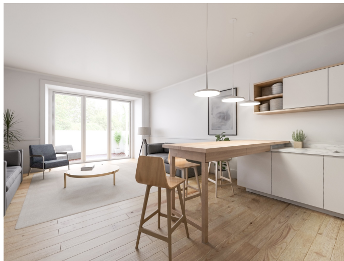
Livingroom – pine hardwood floor - painted plywood wainscot