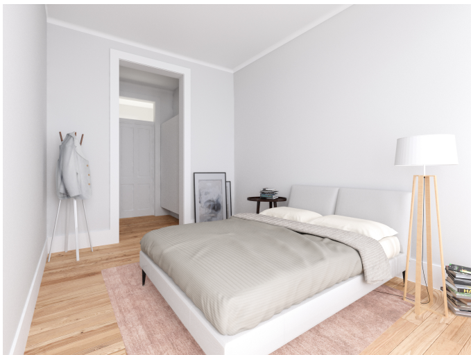
Suite – pine hardwood floor - recovered doors and shutters - Painted MDF doors and agglomerated melamine interiors wardrobe