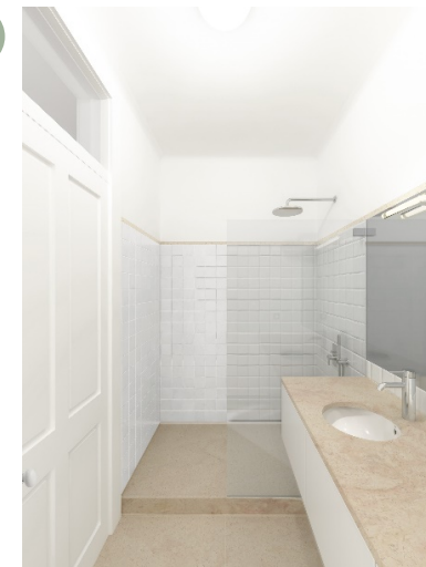
Bathroom (may not correspond to typology) - semi-manual tiles walls - natural stone floor - washbasin with natural stone countertop - natural stone shower tray - Valadares and Water Evolution equipments - towel warmer