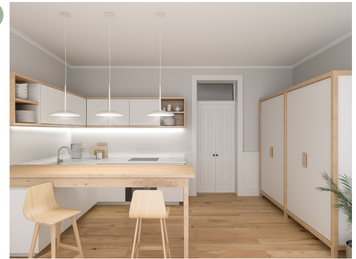
Kitchen- pine hardwood floor - top cabinets with lacquered MDF doors, hard-maple MDF shell and agglomerated melamine interiors – natural stone countertop - Bosch appliances