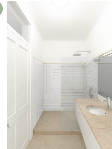
Bathroom (do not correspond to typology) - semi-manual tiles walls - natural stone floor - washbasin with natural stone countertop - natural stone shower tray - Valadares and Water Evolution equipments - towel warmer