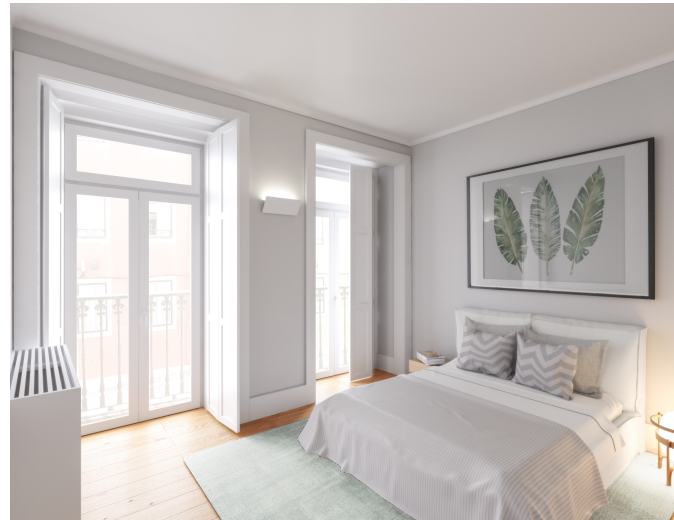
Bedroom (windows do not correspond to typology) - pine hardwood floor - recovered doors and shutters - painted MDF doors and agglomerated melamine interiors wardrobe