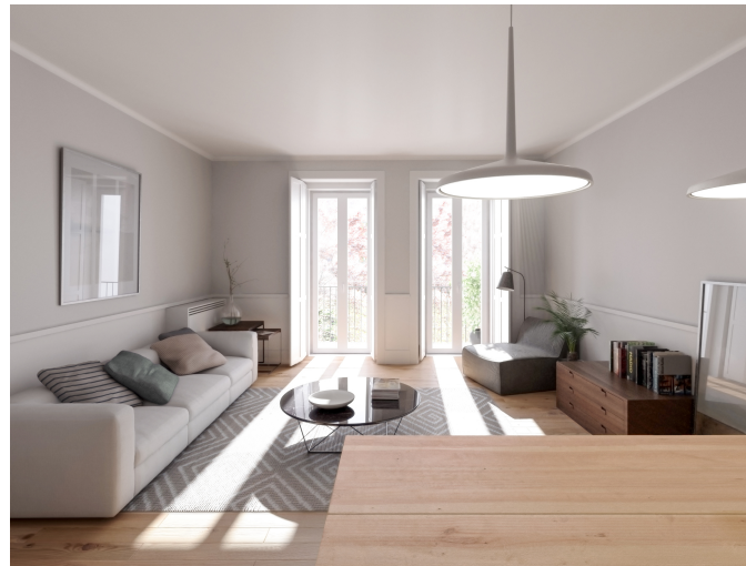
Livingroom – pine hardwood floor - painted plywood wainscot