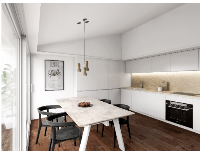
Kitchen - hardwood sucupira floor - natural stone countertop and backsplash - lacquered cabinets doors - electric water heat by Ariston - Bosch appliances (hob, oven, microwave, extractor, dishwasher, fridge freezers, washer-dryer)