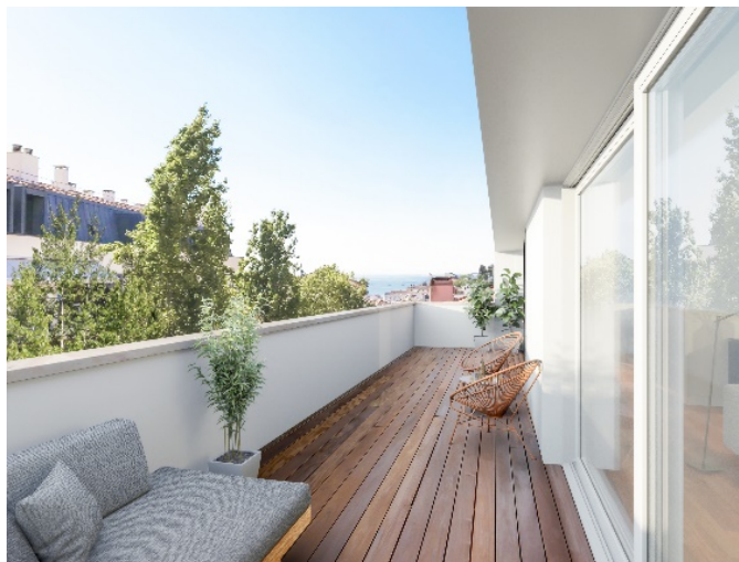
Terrace - hardwood deck - painted walls