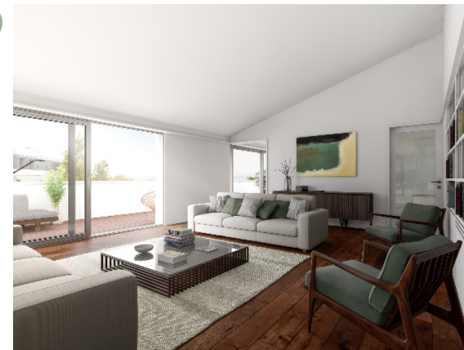
Living room - hardwood sucupira floor - painted wood frames